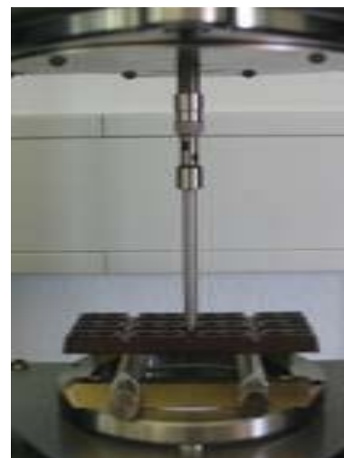
Fig. 1 Breaking test on a chocolate bar on the HAAKE MARS using the new bending geometry

The new bending geometry was used to investigate the breaking behaviour of small bars of milk and dark chocolate. The distance of the support bars was fixed at 5 cm. The piston was cylindrical with a diameter of 6 mm. The piston was lowered at a rate of 1.3 mm/min.