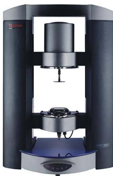
The HAAKE MARS Rheometer

Rheology plays an important role in several steps of chocolate production. The liquid chocolate formulation and the fats used can be characterized by their viscosities, yield stresses and solidification behaviours. These parameters are important for quality control and processing, and can be determined using rotational or oscillation measurements.